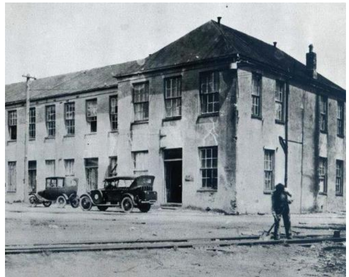
N. Adgers Wharf 1924 with a Lincoln Phaeton and Ford Model T Center Door

Talk with us about our wealth management services. Working together, we can develop a strategy and present customized strategies using our client-first philosophy and resources to help you work toward your financial objectives.