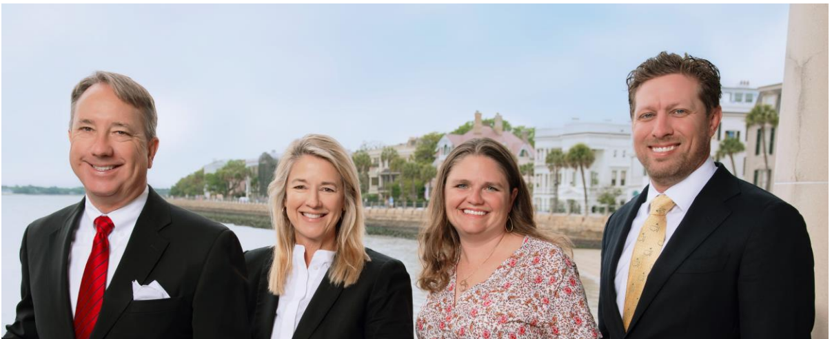
The Nicholson Wealth Management Group

All IWI certified individuals agree to abide by a Code of Professional Responsibility. They also remain up-to-date in their field by completing 40 hours of continuing education every two years.